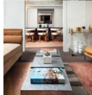
From top: Dream Hollywood's new Guest-House Presidential Suite offers stunning city views; SLS has redone all rooms for its 10th anniversary, including the 1,900-square-foot Presidential Suite; Folia at Four Seasons Beverly Hills features plant-based dishes such as mushroom and squash tacos with cashew crema.