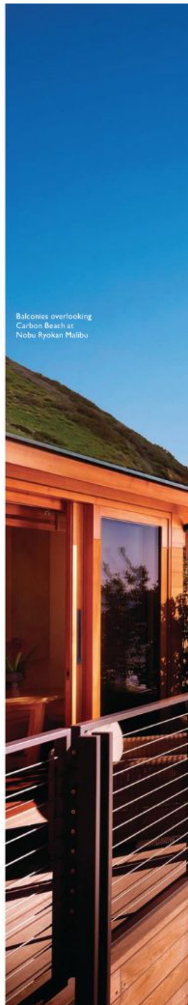
Balconies overlooking Carbon Beach at Nobu Ryokan Malibu

Finally, for those wanting a respite from Indian summer, The Peninsula Beverly Hills (from $665 per night, 310.551.2888, peninsula.com) has completed a cabana renovation, including one dedicated to poolside spa treatments. Offering privacy sheers, new furniture and a 49-inch flat-screen TV, the staffed cabanas also come with treats like smoothies, green wellness shots and a fully stocked fridge. Nonhotel guests can reserve a cabana ($450 per day, up to five people), which includes full-day use of the pool, steam room and showers. With restorative properties like these in your very own backyard, who needs to head out-of-town? ■