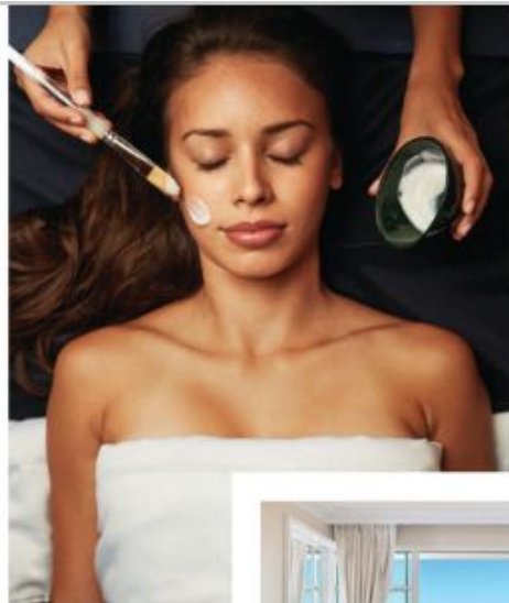
From top: A relaxing spa treatment at Mr. C Beverly Hills, newly managed by SandSpa. Mr. C Beverly Hills also offers a restorative package stay, which includes a night in a suite.