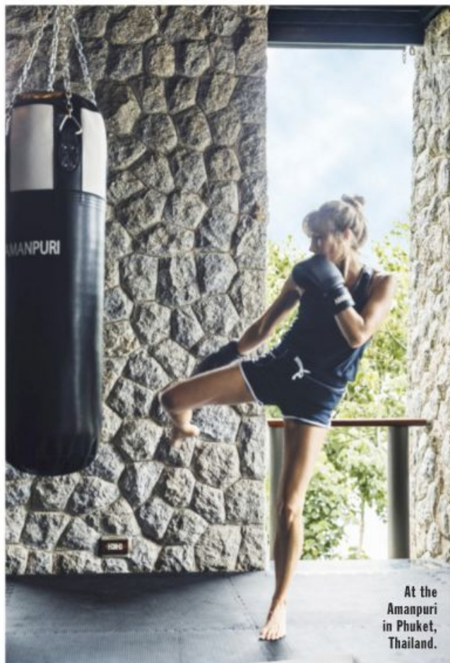
At the Amanpuri in Phuket, Thailand.

Two classic West Coast temples of wellness have relaxed—really relaxed—their time commitments. Baja California's Rancho La Puerta condenses the best of the best in its new "Saturday at the Ranch" program. You can sign up for the full roster of activities, which include fitness classes, a guided two-hour hike (through flat-out spectacular, rugged terrain), a 50-minute signature massage, a garden tour, a cooking demo, lunch, and some pool time—or pick and choose ( RANCHO.LAPUERTA.COM ). Near Los Angeles and with dramatic views of the Pacific, Terranea Resort just launched "daycations" devoted to single themes—such as mindfulness and heart health. Pampering and fitness (a 60-minute massage, seaside yoga, a coastal bike ride) are complemented by educational workshops ( TERRANEA.COM ).